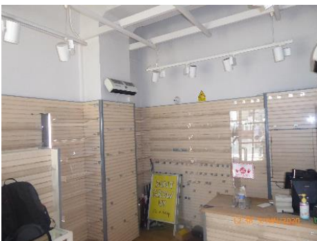
Figure 7. Unit 6, Interior