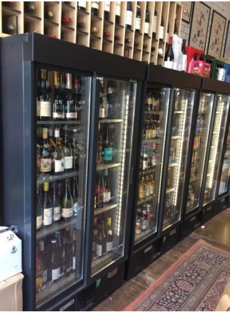
Figure 3. Seven Cellars, 104a Dyke Road -inside showing refrigerated stock