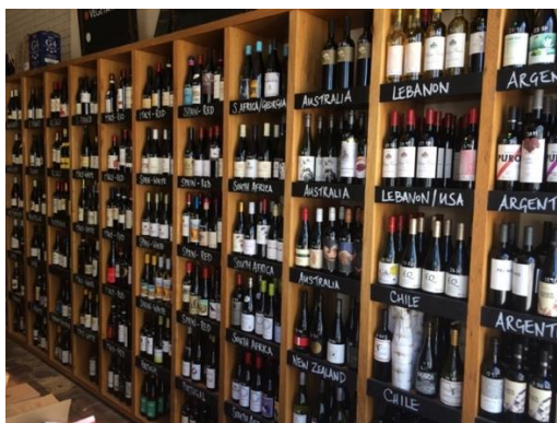
Figure 2. Seven Cellars, 104a Dyke Road inside shelving