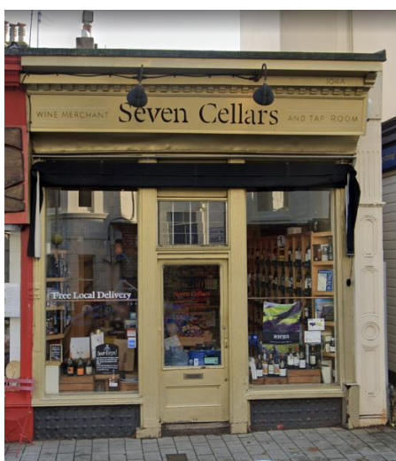
Figure 1. Seven Cellars, 104a Dyke Road, BN1 3JD

Seven Cellars Ltd has been established with a shop in the Seven Dials area in Brighton since 2015.